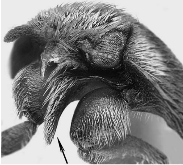
Fig. 4. Attagenus heinigi n. sp. Fore body showing the prosternal process (arrow).

Female: Habitus similar to male. Body measurements: TL 3.2 mm, EW 1.9 mm.